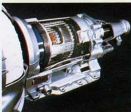
Optional Tri-matic 3-speed automatic makes driving easy.