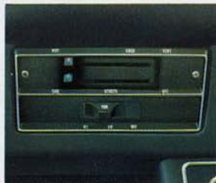
Fan boosted heating/demisting is standard.