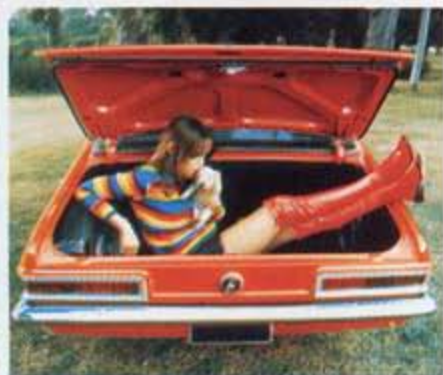
Luggage-swallowing 18 cu. ft. boot.